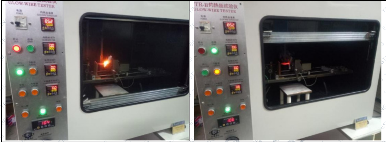
Fig.2 During test sample picture